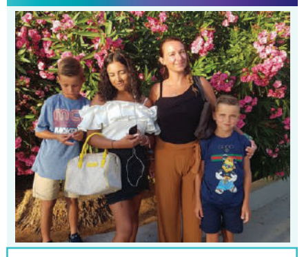
A sense of place in the world