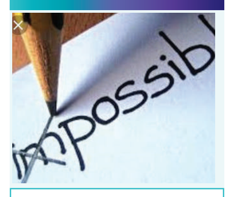
Time well spent (Re-prioritisation)